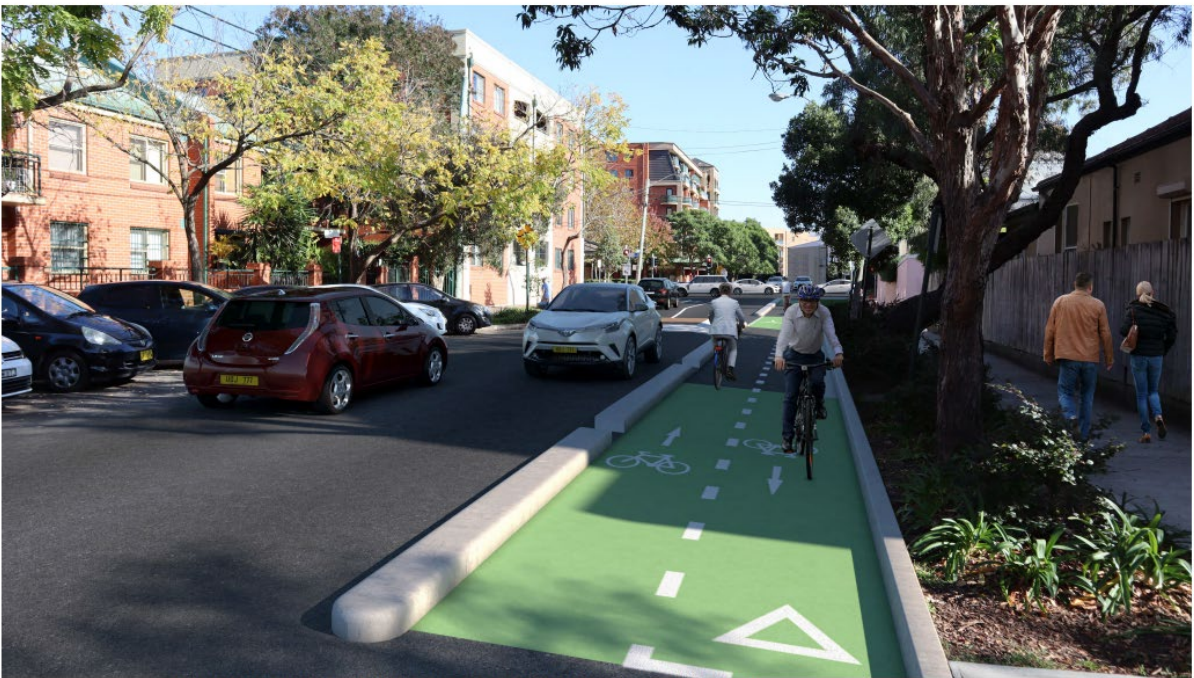
ARTIST'S IMPRESSION 2: PROPOSED VIEW NORTH-WEST ALONG HUNTLEY STREET NEAR BELMONT STREET INTERSECTION